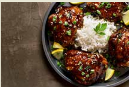
GRILLED CHICKEN THIGHS WITH SOY, ORANGE, GINGER & COCONUT RICE

Enjoy our extensive collection of recipes to pair with your favorite Gold Medal wines!