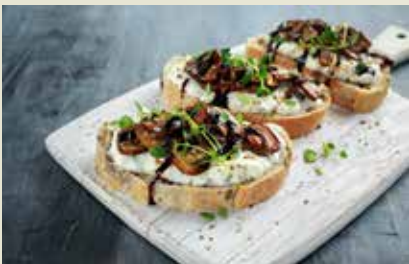
BURRATA AND WILD MUSHROOM TOASTS

Enjoy our extensive collection of recipes to pair with your favorite Gold Medal wines!