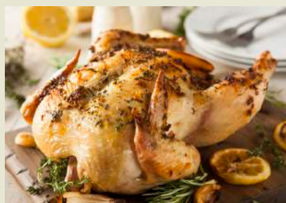
ROASTED CHICKEN KESSLER WITH LEMON AND FRESH HERBS

Enjoy our extensive collection of recipes to pair with your favorite wines! Find these and many more recipes online at GoldMedalWineClub.com/Recipes .