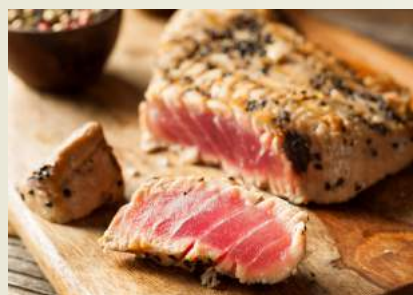
HAAK'S SEARED AHI TUNA