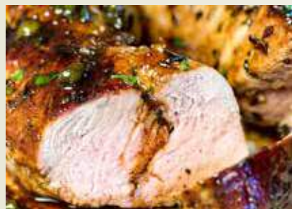
BALSAMIC ROAST PORK TENDERLOIN