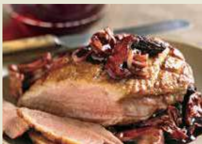
SAUTÉED DUCK BREASTS WITH WILD MUSHROOMS

Enjoy our extensive collection of recipes to pair with your favorite wines! Find these and many more recipes online at GoldMedalWineClub.com/Recipes .