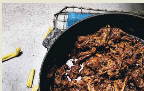
SHORT RIB CHILI