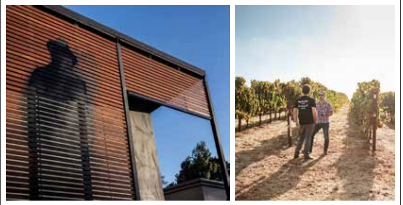
Photos, top to bottom, left to right: