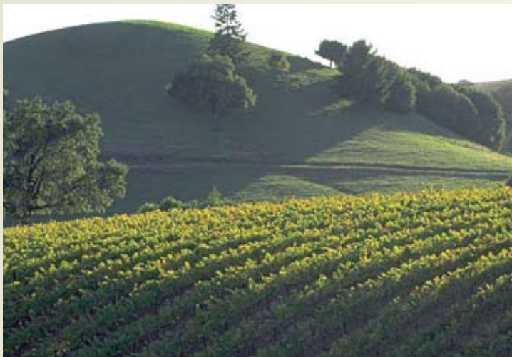
Views of the beautiful Sonoma County vineyards sourced by Willowbrook Cellars and the happy, hardworking team during harvest.