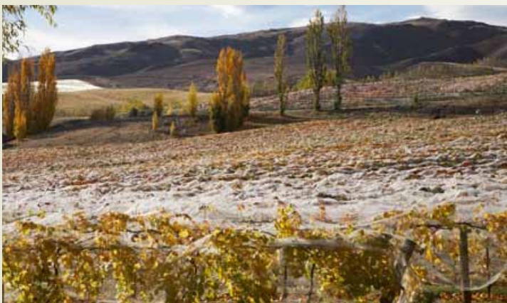
Snow-covered mountains surround the valleys of Bannock Brae's estate Pinot Noir vineyard; barrels of aging Pinot Noir; hand harvested Pinot Noir grapes; Bannock Brae's expansive estate.