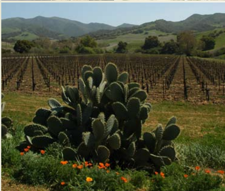
The Alma Rosa vineyards are certified 100% organic.