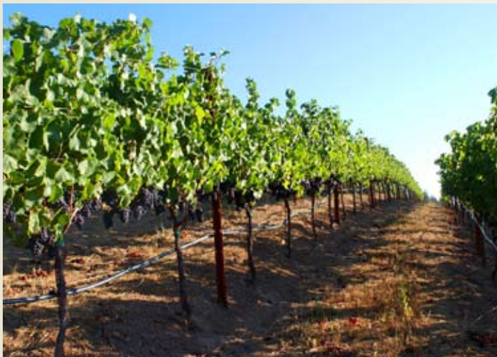
Views of the beautiful Londer Vineyards Estate in Anderson Valley, California.